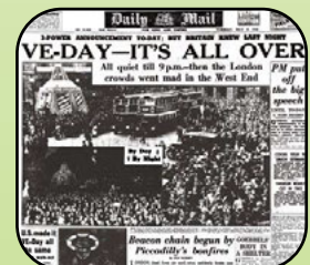
VE day newspaper

VE day stands for Victory in Europe Day . VE Day celebrates the end of the war in Europe on 8th May 1945 .