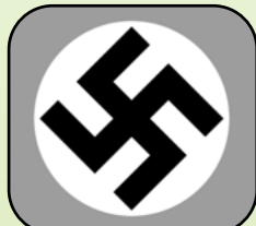
A swastika - the Nazi symbol

The Nazis were a political group who believed that Aryans (people with blond hair and blue eyes) were the best race of people and that everyone else was inferior. Hitler was the leader of the Nazis and wanted to get rid of everyone in Germany who wasn't Aryan so that Germany would be the best country in the world. They also believed that they would be the best people to rule the world.