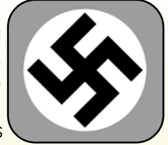
A swastika - the Nazi symbol

'Nazi' was the shortened name for a German political party called the National Socialist German Worker's Party. The Nazis believed that Aryans (white people with blond hair and blue eyes) were the superior race and that all other people were 'lesser' races. They wanted to make the Aryan race the strongest in the world and make Germany a powerful world leader once more.