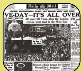
VE day newspaper

During the course of the war, the Axis power had managed to invade and occupy lots of different countries. However, by 1943 Italy had changed sides and was now fighting with the Allies. The Allies became too strong for the Axis. They started freeing the occupied countries. Hitler realised he was going to lose the war so on 30th April 1945 he committed suicide. A week later Germany surrendered.