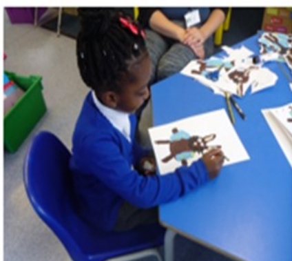
We painted Peter Rabbits for our Beatrix Potter display