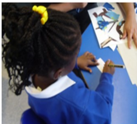
We labelled the vegetables that Peter Rabbit ate.