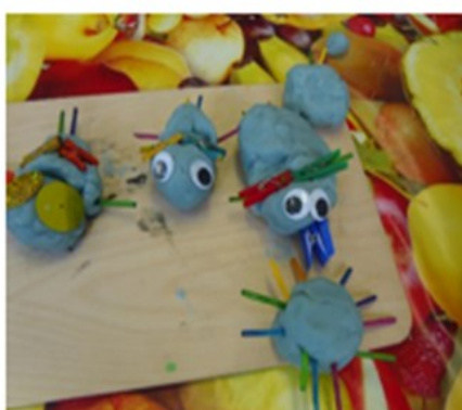
We made creatures with play dough