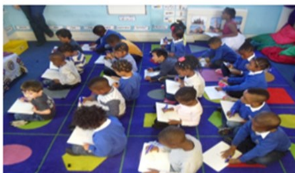
We do Phonics every day in Reception