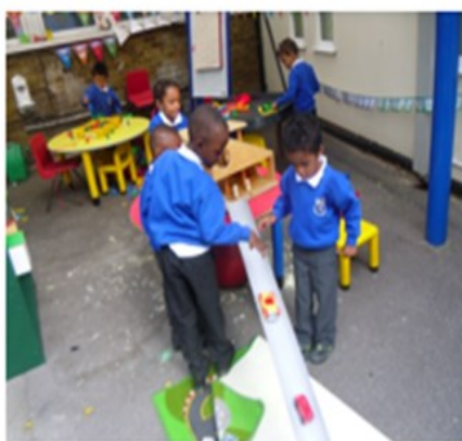
We played with cars